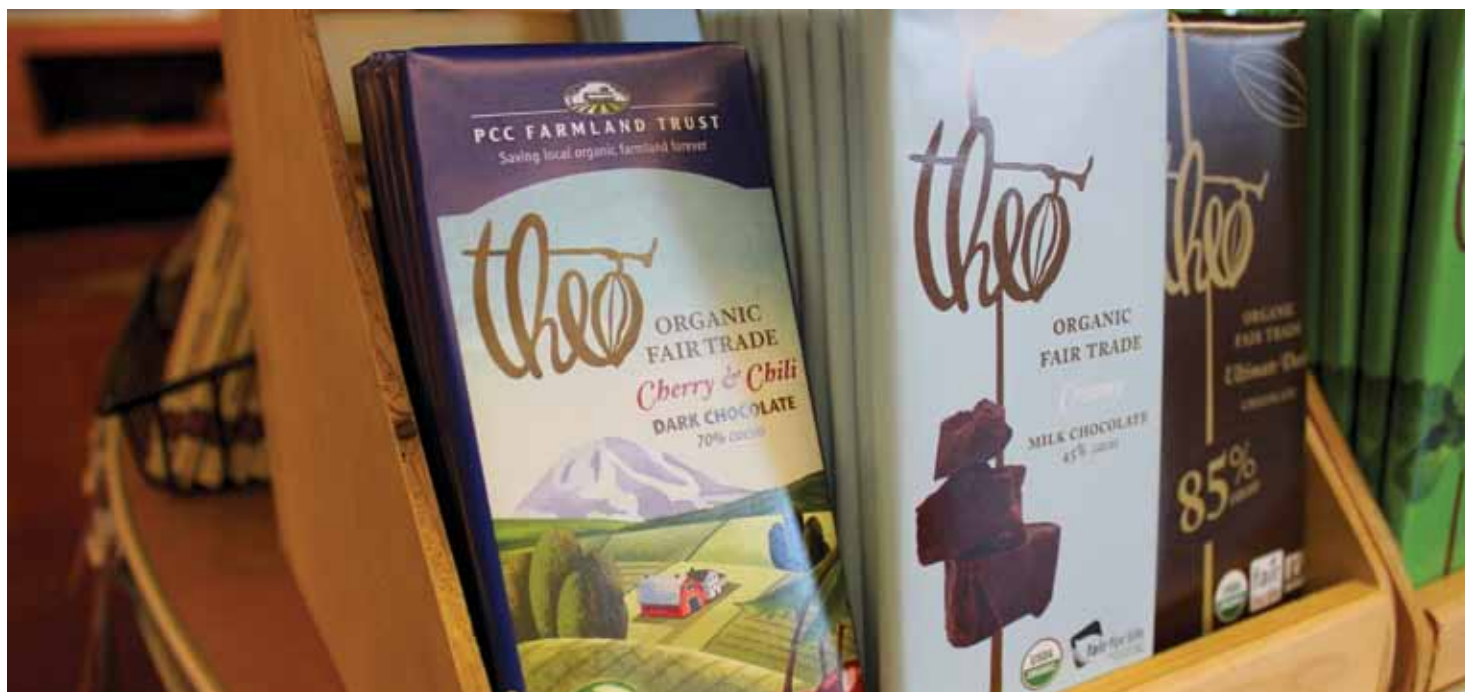
PCC Farmland Trust and Theo Chocolate's Cherry Chili Chocolate bar